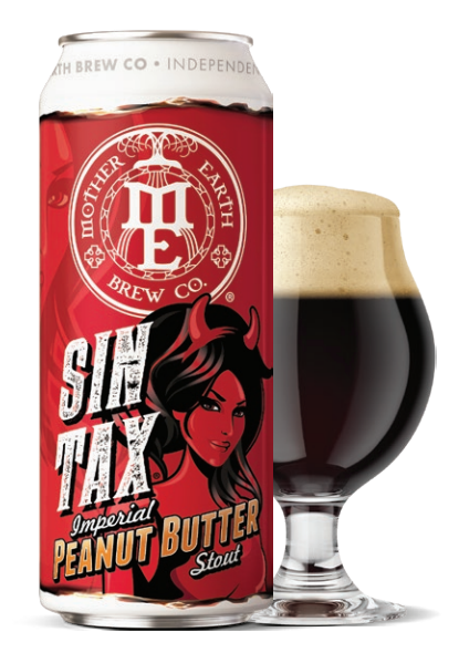
SIN TAX IMPERIAL STOUT / 8.1%

Our Anniversary Ale, and a BIG one at that. At over 10%, with an intense but balanced tropical hop character.