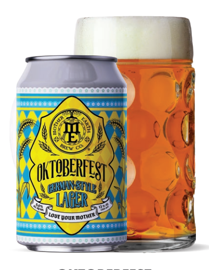
OKTOBERFEST GERMAN-STYLE LAGER / 5.0%

Featuring authentic German Pilsner, Vienna, and Munich malts that produce strong honey, and toasted bread flavors.