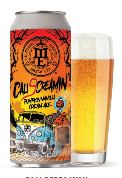
CALI SCREAMIN' PUMPKIN VANILLA CREAM ALE / 5.0%

Featuring authentic German Pilsner, Vienna, and Munich malts that produce strong honey, and toasted bread flavors.