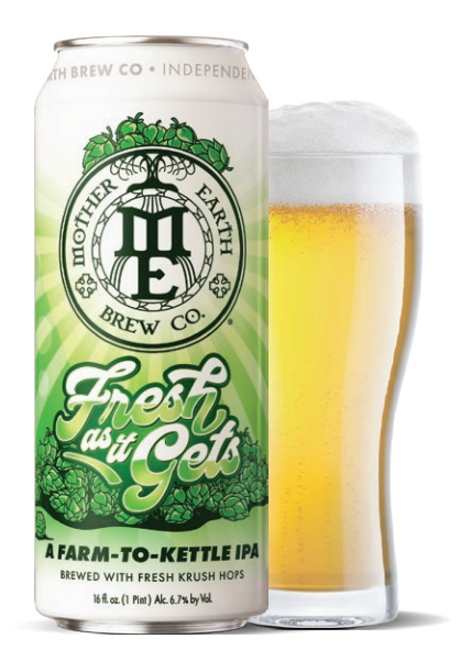
FRESH AS IT GETS FRESH HOP IPA / 6.7%

Featuring pumpkin, vanilla and traditional baking spices that create a terrifyingly tasty twist on our category-defining brew.